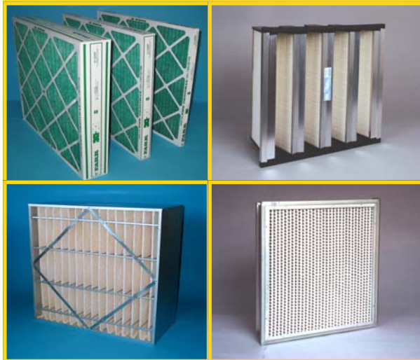
Top left: Camfil Farr 30/30°

Combines absolute, high efficiency ASHRAE filter and prefilter in one easy to service assembly